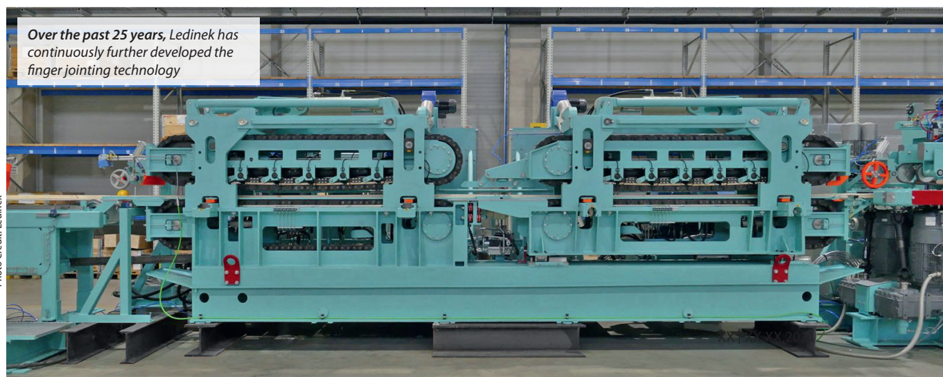
Over the past 25 years, Ledinek has continuously further developed the finger jointing technology